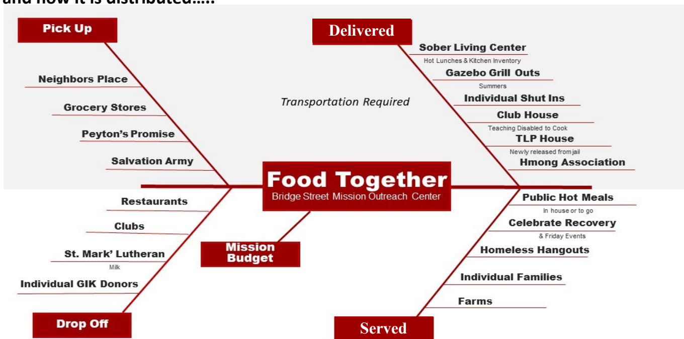
Bridge Street Mission Food Flow