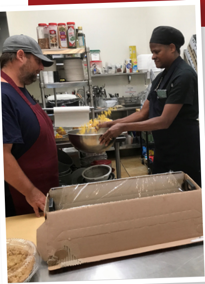
One facet of our vocational training helps men learn to cook and work in a kitchen.